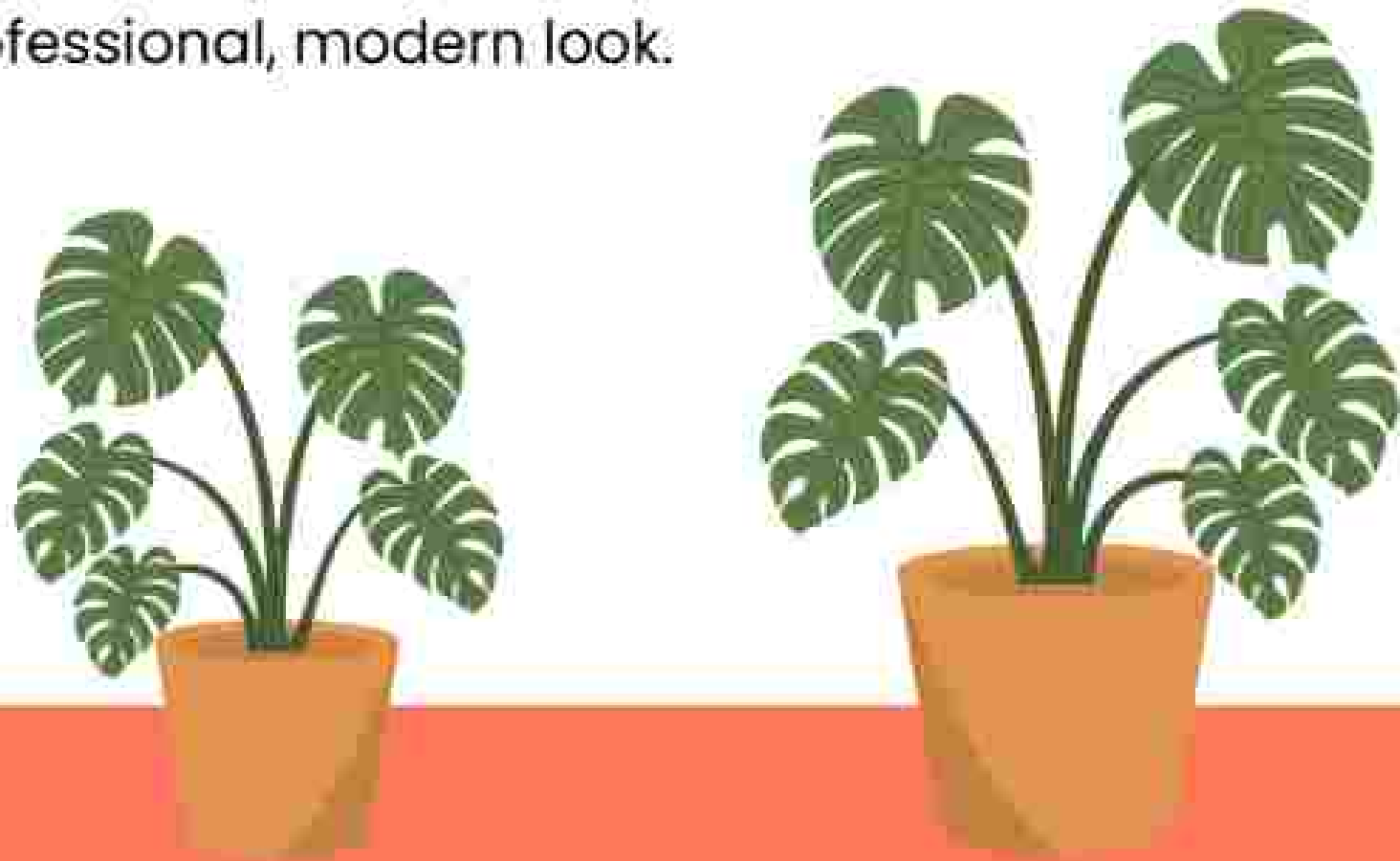
Table material affects aesthetics and durability. Choose materials such as wood, metal, or glass that are not only durable, but also provide a professional, modern look.