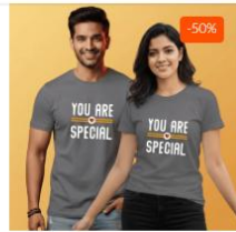
You are Special T-Shirt for Couple Same Design, Multiple Colors Available Rs. 1,998.00 Rs. 999.00