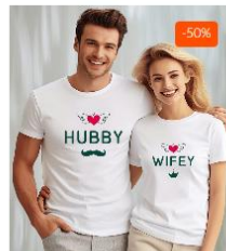
Hubby Wifey T-Shirt for Couple Available Online Rs. 1,998.00 Rs. 999.00