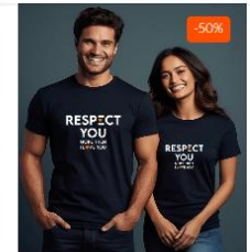
Respect You Couple T-Shirt Combo Pack of 2 Rs. 1,998.00 Rs. 999.00