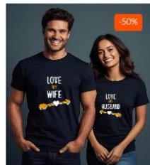
Love My Husband & Wife Matching Couple T-Shirts Rs. 1,998.00 Rs. 999.00