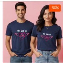
We Are in Love Cute Couple T-Shirt for New Relationship Rs. 1,998.00 Rs. 999.00