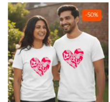
Love You Romantic Couple T-Shirt Matching Combo Rs. 1,998.00 Rs. 999.00