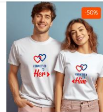
Connected to Him & Her Couple T-Shirt Perfect for Valentines Day Rs. 1,998.00 Rs. 999.00