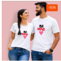
Be Mine Couple T-Shirt Combo Pack in Multiple Color Rs. 1,998.00 Rs. 999.00