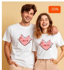
Love Branch Design Couple T-Shirt Pack of 2 Combo perfect for Husband & Wife Rs. 1,998.00 Rs. 999.00