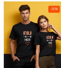
Stole Her Heart Love Couple T-Shirt Combo Online Rs. 1,998.00 Rs. 999.00